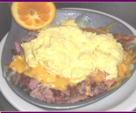
Home of the Original Melting Pot

All Skillets are made w/ hash browns & onion, topped w/ two fried eggs & served with toast or small Pancakes. Poached eggs or egg whites- add .50