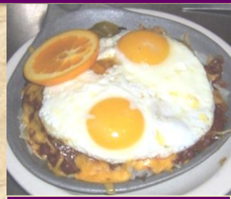
Breakfast served all day

Diced sausage links with American cheese. 9.99